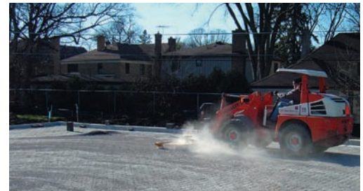
Mechanical sweeping of fine aggregate into paver joints