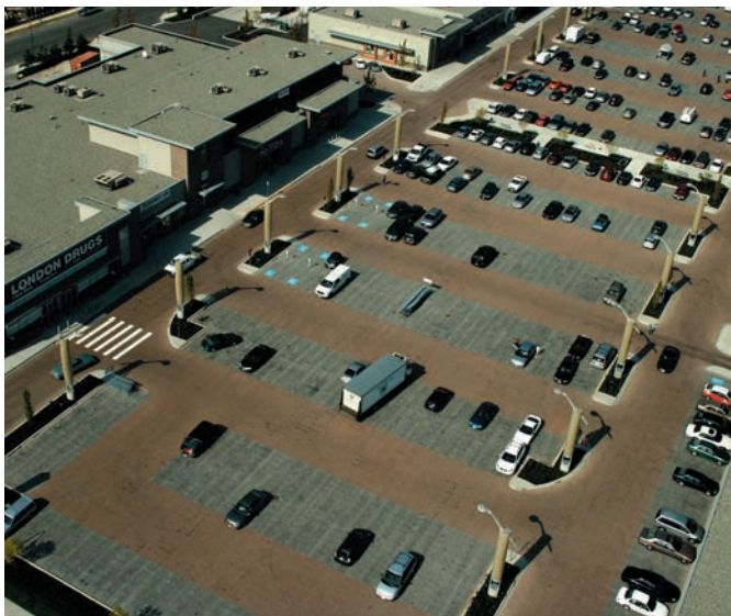
350,000 sf (3.2 ha) of PICP at a Burnaby, BC shopping center infiltrates runoff from roofs.