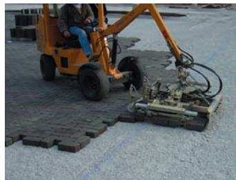
Pavers are delivered ready to place, joints filled, compacted and then are ready for traffic.