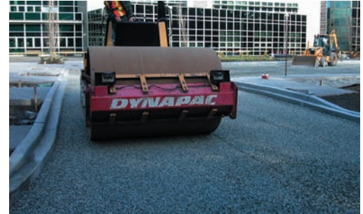
Aggregate base and subbase are spread and compacted; pavers are delivered ready to install. After placement, joints and/or openings are filled with small aggregate. Then pavers are compacted.