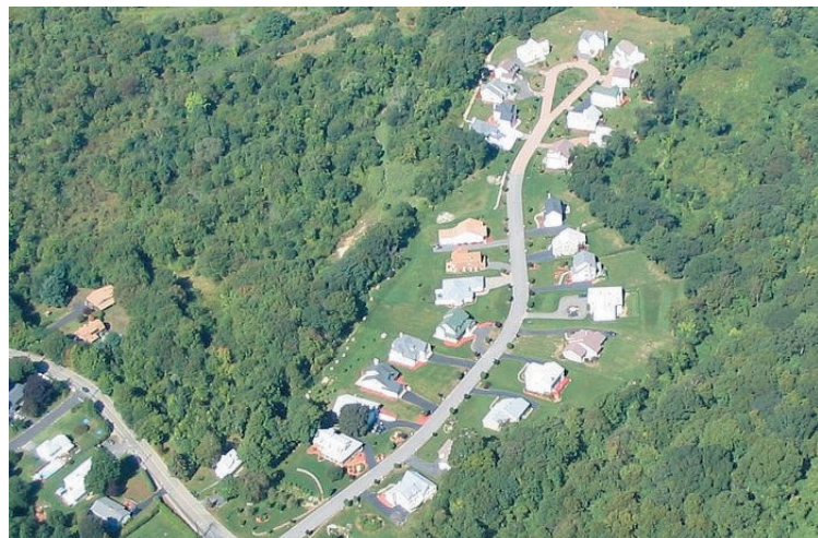
By eliminating detention pond, the subdivision layout conserves trees while 15,000 sf (1500 m 2 ) PICP in the cul-de-sac returns rainfall to the water table in Glen Brook Green subdivision in Waterford, CT.