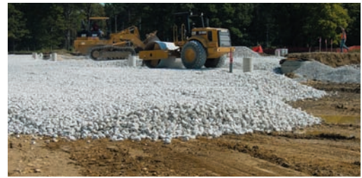
Base construction uses locally available materials.